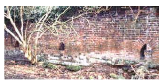
Above, the three bee boles

In the nineteenth century a stone gateway with carved lionesses, leading to the garden was removed and re-erected at Dorfold Hall in Nantwich.